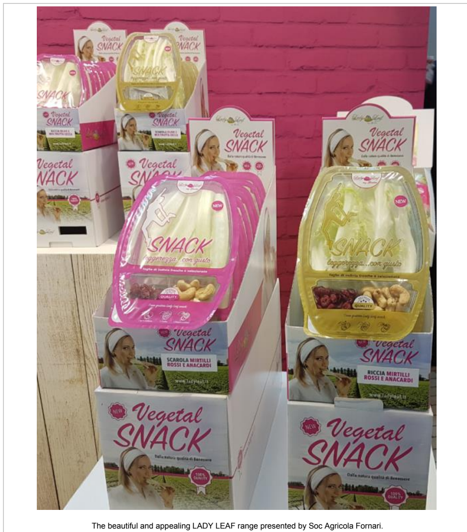
The beautiful and appealing LADY LEAF range presented by Soc Agricola Fornari.